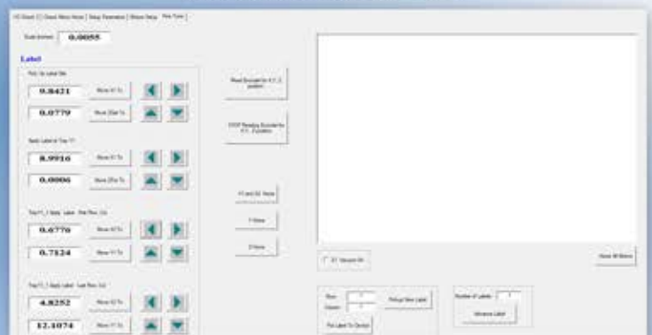
Intuitive Windows 10-based GUI