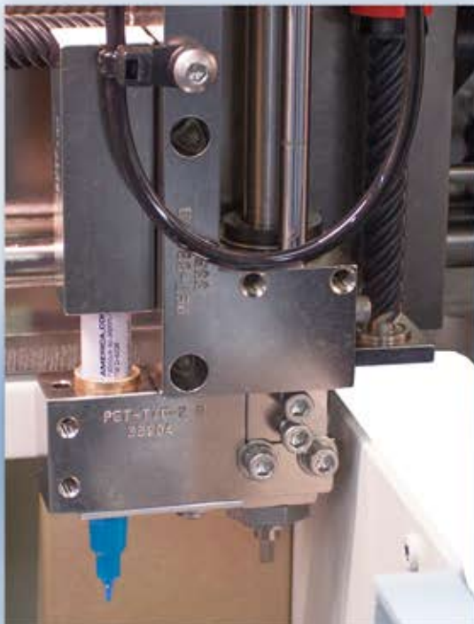
Ink Pen Attachment Mounted