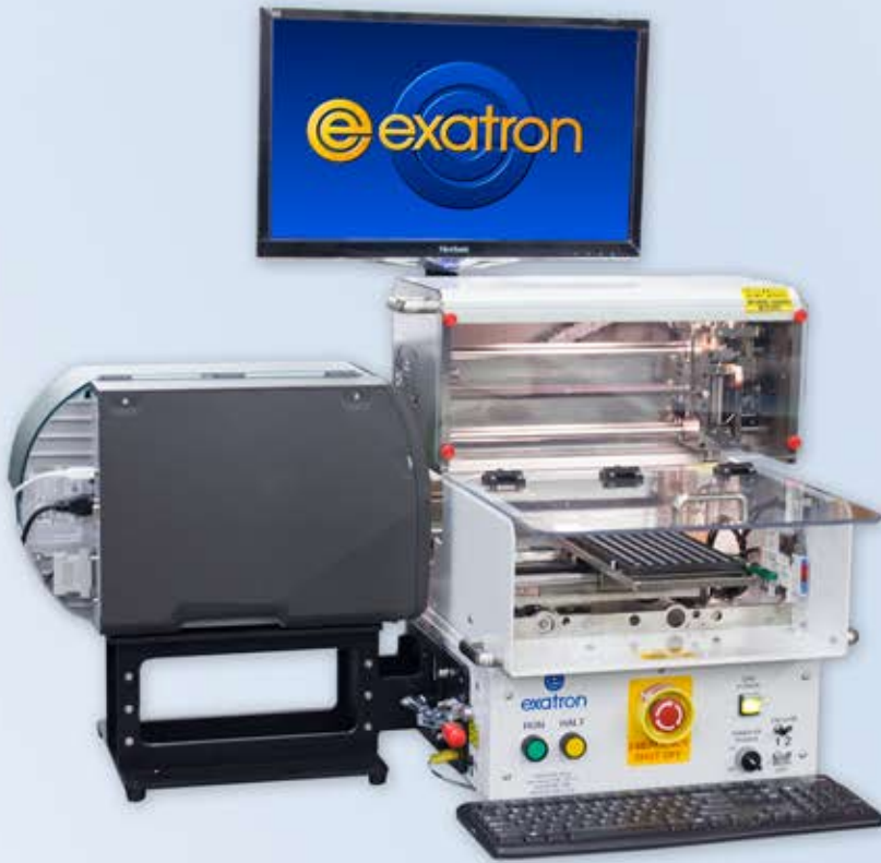
TABLE TOP LABEL/INK DOT APPLICATION HANDLER