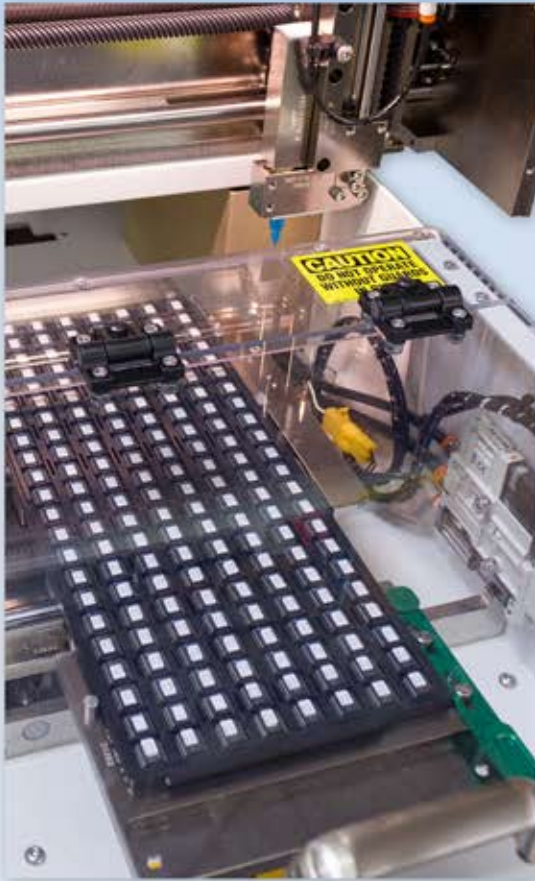
Inking Changeover Kit