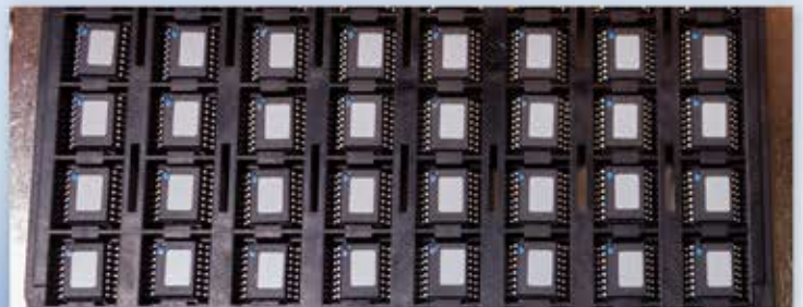
Inked and Labelled Devices